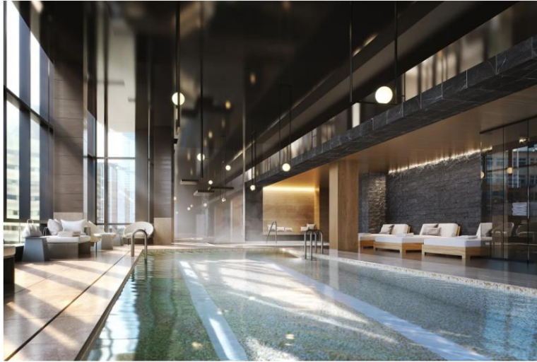
A rendering of the 20-meter indoor pool at Raffles Boston Back Bay Hotel & Residences.

Scheduled to open next year, St. Regis Residences is located on the Seaport waterfront and has an architectural style that's inspired by a ship's mast and sail. Residents can enjoy city and harbor views from their floor-to-ceiling windows and Juliette balconies. They also have the option to lease a boat slip at the nearby pier and can take advantage of a yacht charter membership plan that gives them access to a fleet of crewed Hinkley Yachts.