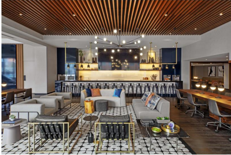
The Innovation Center at EchelonSeaport.