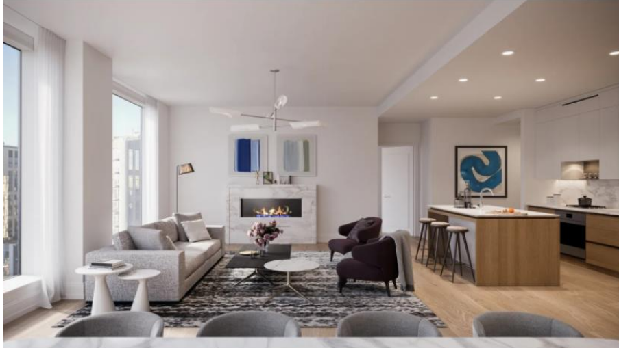
A beautiful residence at The Quinn.