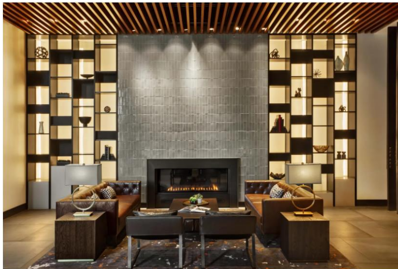
A cozy lounge with a fireplace at The Alyx.

Comprised of two condominium towers—133 Seaport, A Regent Collection and 135 Seaport, A Regent Collection—Echelon Seaport is a 3.5-acre, 1.33 million-square-foot, mixed-use waterfront development. The towers are linked by a bridge and feature a central courtyard with plenty of areas to sit. Residents enjoy city and water views from their homes and can avail themselves of an impressive 60,000 square feet of amenities. The long list includes two outdoor pools, an indoor infinity-edge pool, a fitness center with an indoor basketball court, a spa, two sky lounges, an outdoor dog run and pet spa, and golf simulator.