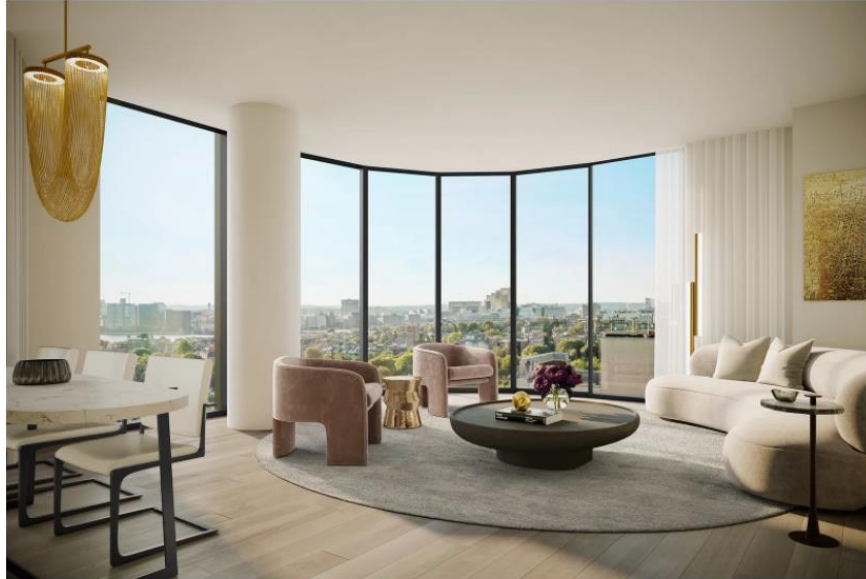
The living room in a one-bedroom unit at The Parker.

Also part of EchelonSeaport, The Alyx has 270 apartments for rent. It features a stepped-tower design and terraces with city and water views. Amenities include a 75-foot outdoor swimming pool, a 24-hour gym with on-demand fitness classes, an outdoor wellness space for yoga and fitness classes, an outdoor dog run-and-play park, and multiple resident lounges.